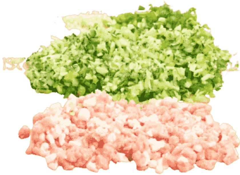
Mincing of meat and vegetables