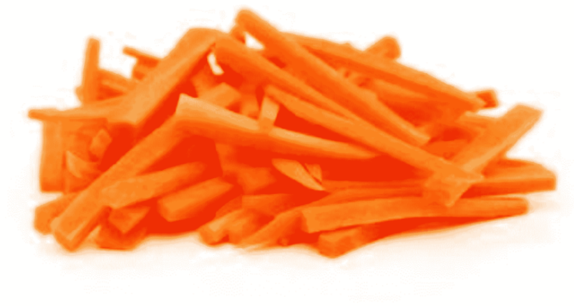
Julienne/ allumette(Match stick cuts)