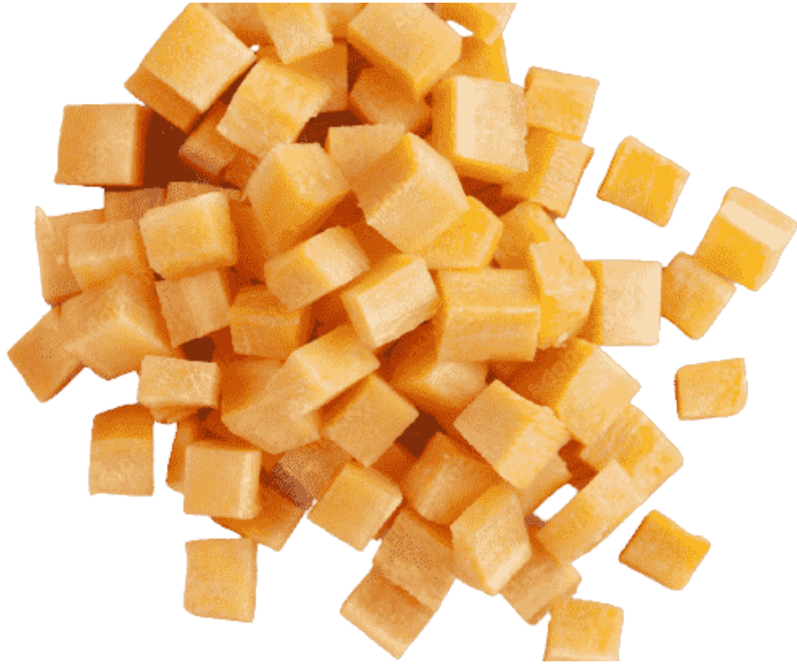
Brunoise (Fine Dice)